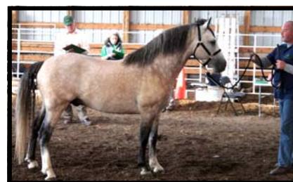
Inspection action at Brian Donnegan's