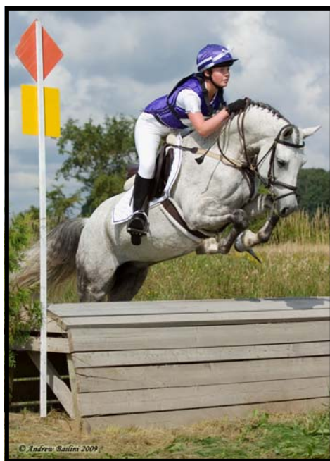
Irish Park's Turf Fire Cedarhill's Reendesert Lass x Hideaway's Sebastian

The 2009 season was our first year of real eventing and it has been very successful. We started at the entry level, attended 10 horse shows during the season and placed at all but one. We were 2 nd at the OHTA Championships at Headwater Horse Trials in September – and best of all, Turfie helped me win the Entry Level