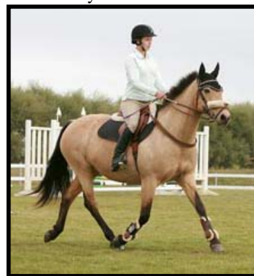
"Fiesta", (Avenn's Golden Legacy) is a 1990 mare by Lynfield's Cormac MacCarthy x Avenn's Golden RubyHawk.