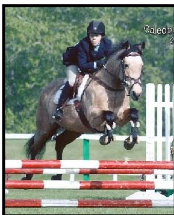
One of my favorites was the

We went to many shows this summer, starting with the Caledonia Horse show and ending with the Gorsline Fall Classic.