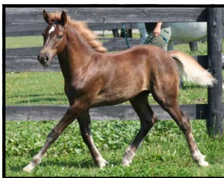
Century Hill's Hazy Meallan— 3 mo

many good comments. The inspectors also passed Eastie for premium and Rea was approved.