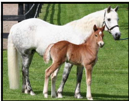
Annie & Meallan at 3 wks