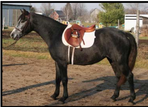
Century Hills Eryn Babatjie

Hayselden Perseus x *Eastlands Glendearg