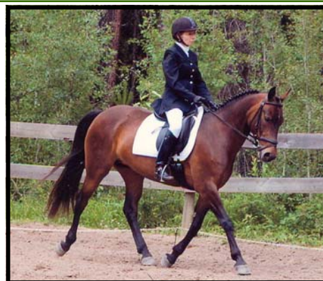
W.C. Celtic Legacy ( Lynfield's Cormac MacCarthy x Melody(Grade pony))

Celtie and I have been having fun at Horse Trials for the past 6 summers- we persevered even though the first couple seasons were not successful at all. We both are more confident now; in 2008 we received champion for entry level at the year-end awards. Dressage has become a large part of our training and showing as well. During the last couple of years we competed at first level and hope to show at second level in 2009. For me, Celtie is the perfect size, with tons of athletic ability and desire to work hard. What a great pony!