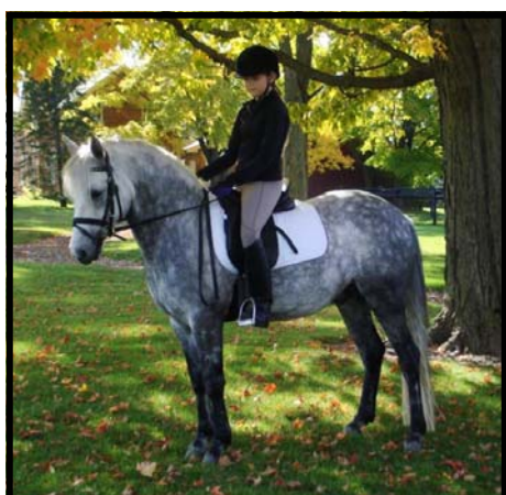
Ally on Erin Meadows Tir na N'og (Loughrea's Oisín x Erin Meadows Celtic Treasure )