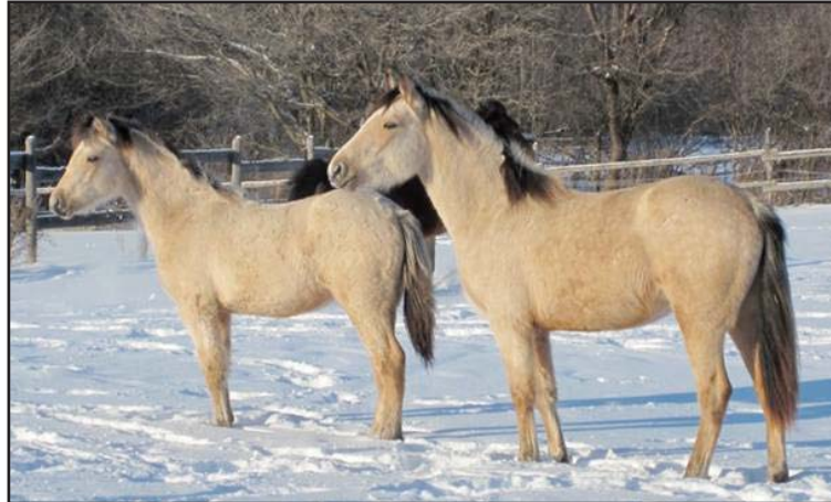
Caraway Poppy and Caraway Gilly 2009 and 2010 full sisters Irish Park Caraway Finn x Stonybrook Irish Creme