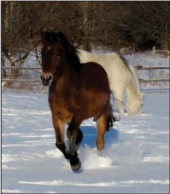
Caraway Byron 2008 Gelding Irish Park Caraway Finn x *Hearnesbrook Shooting Star