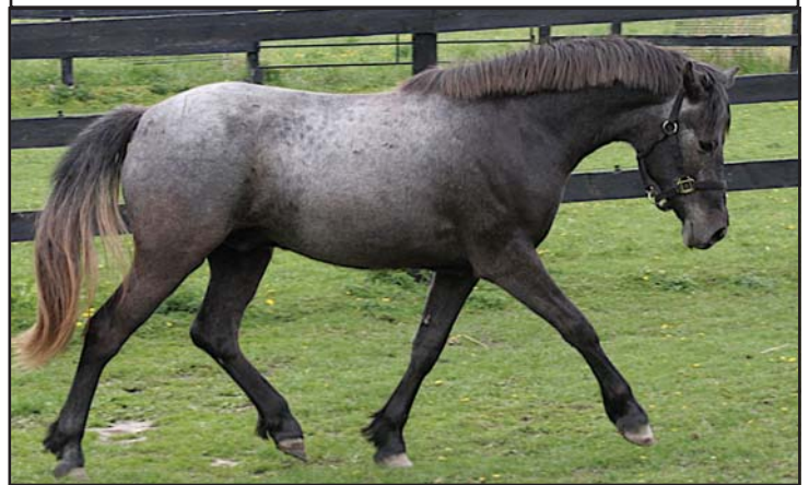
Century Hill's Good Vibrations

rpdoner@sympatico.ca www.centuryhillfarm.com