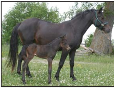
Belfast Button & foal

Lissadell Farm is offering for sale the following ponies. Belfast Button is a 6yr. old brood mare. She has had three male foals and is currently open. Her foals are also for sale: Lissadell Oisin is a rising 3yr. old silver roan gelding, has good stable manners, a sweet nature and is in training, Lissadell Dun Eoin is a rising 2 yr. old dun gelding well handled. Both geldings will stay pony size and have natural jumping ability. Lissadell Sandstone is Button's foal from 2010. He is a flashy bay roan who would make an excellent stallion prospect. Their sire, Tintagel Tibyl, a son of Hohnhurst Brannigan, will be offered for sale as a gelding. He is rising 5 yrs. old and has sired 5 colts and a filly. He has been backed and is handled daily. He deserves a career as a show pony as he is very flashy and has no job as we are not breeding. Lissadell Zepp Lynn is a rising 5 yr. old grey mare by Belfast Bonfire who was also Button's sire. She had a filly foal this year but is currently open. She has passed inspection. Zepp Lynn's mother has been sold but her half brother Lissadell Ronan a red roan 2010 is also offered for sale. All stock are registered purebreds. 2010 foals have been DNA tested. Information on pedigree can be seen on the farm website: lissadellfarm.com and/or call Mary Flynn 613 433 5824. Email: flymar@hotmail.com