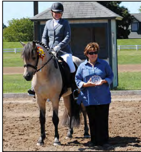
Tintagels Tibyl receiving his Reserve Champion crystal plate at the National Dressage Pony Cup KHP