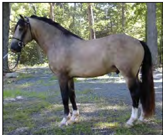
Morning Glorys Ilyushin