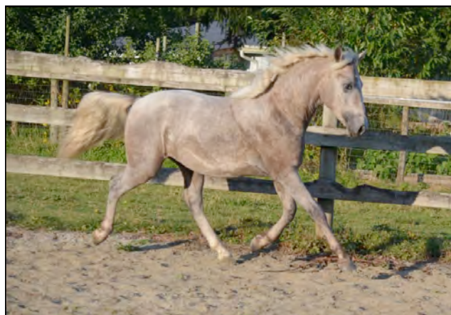
Joshua 1:9 – summer 2012 yearling colt by Ard Celtic Art