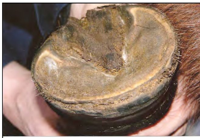
This is a picture of a typical HWSS lesion.