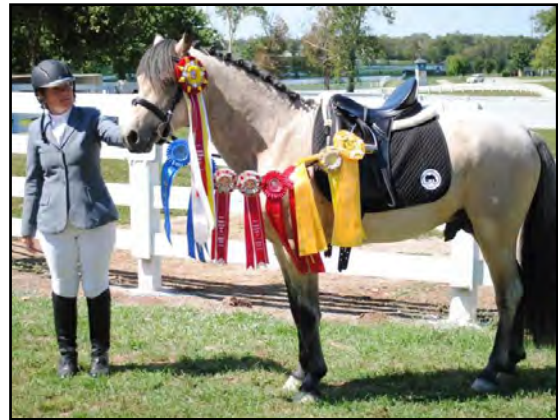
Tintagels Tibyl in the ribbons at the Kentucky Horse Park National Dressage Pony Cup