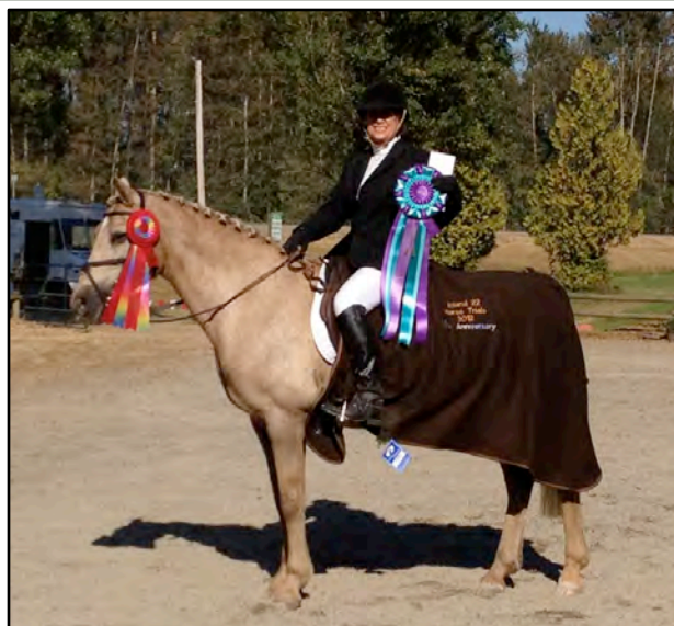
BC Championship 2012 – Pre-entry, Sr.