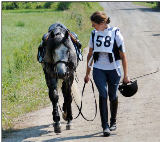
Another good show!!