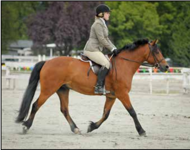
DEVON RIDGE HARRIS HAWK