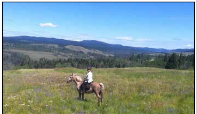
Carolyn and Honey at the 7 1/2 Diamond Ranch

My friend, Carolyn and I took Honey and Lacey on a camping trip in the summer with 14 other ladies from our Vintage Riders Club for a 4 day, 3 night weekend at a ranch in the Interior of BC. What fun we had! Great cabins to stay in, nice paddocks