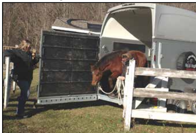
Callie at her new home