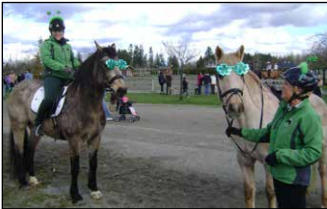
Honey and Ceildh before the demo