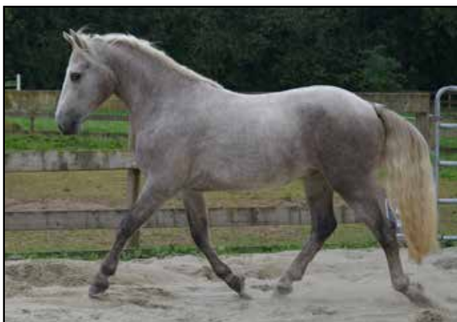
For sale - Ballencrieff's Joshua 1:9 - ad pg 23