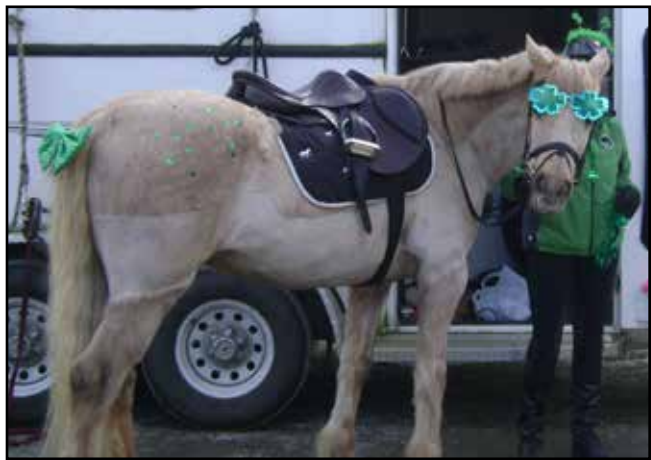
Honey getting dressed