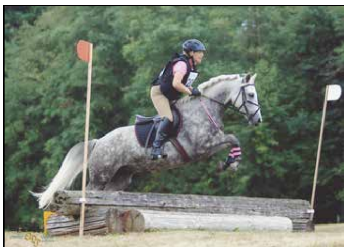
Ballencrieff's Winter Lace 2013 Campbell Valley Event