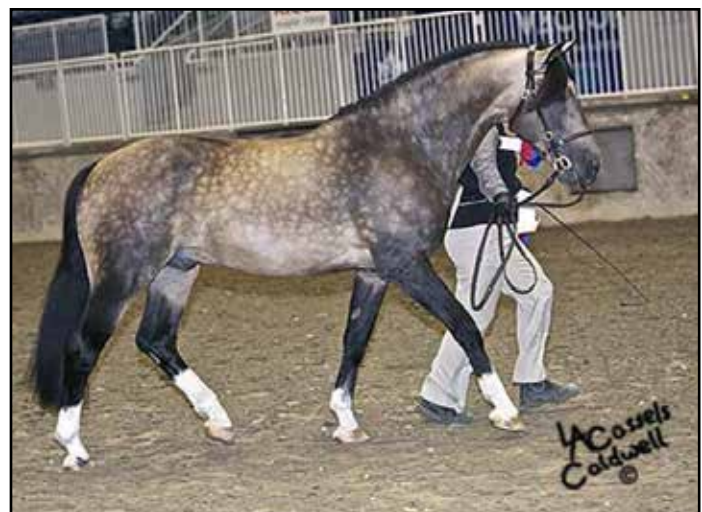
Ilyushin at the Royal