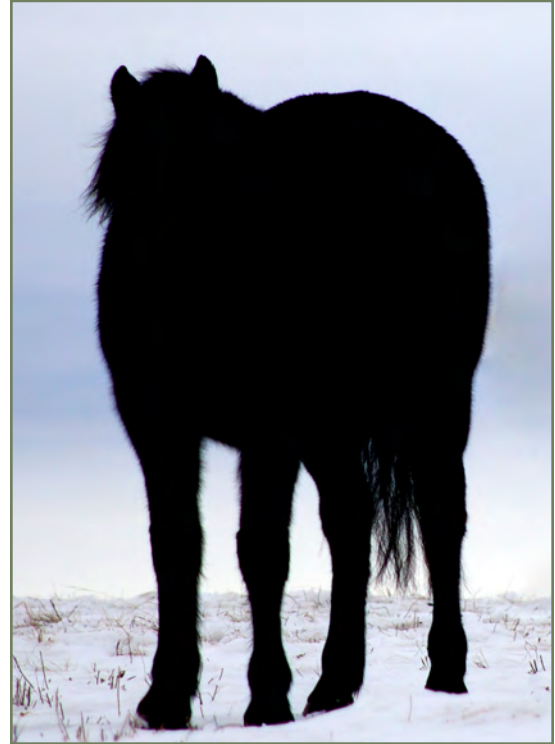
Are we facing forward or backwards??

An exciting crossbred foal is expected from Gayle Smith's Premium Canadian Warmblood mare, Ebon's Finally Friday (sire MJ Fusion), bred to Aedan.