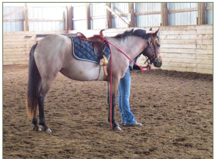
Eden Sugar N Spice