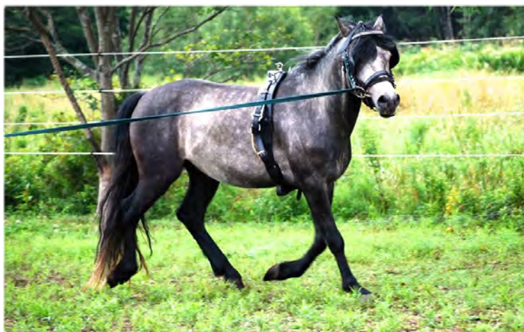
Prince loves to work