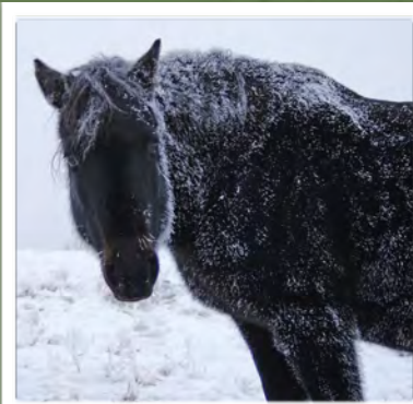
Frost-dappled Rills Kelpie "Will it be spring soon?"

The 2015 AGM will be held in the Prairie region.