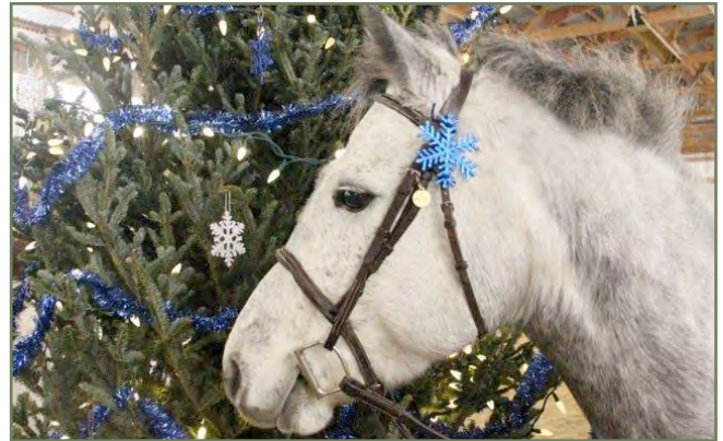
Kestrel Fair's May Girl where she belongs - in front of the bright lights! Quarry Ridge Christmas Quadrille.