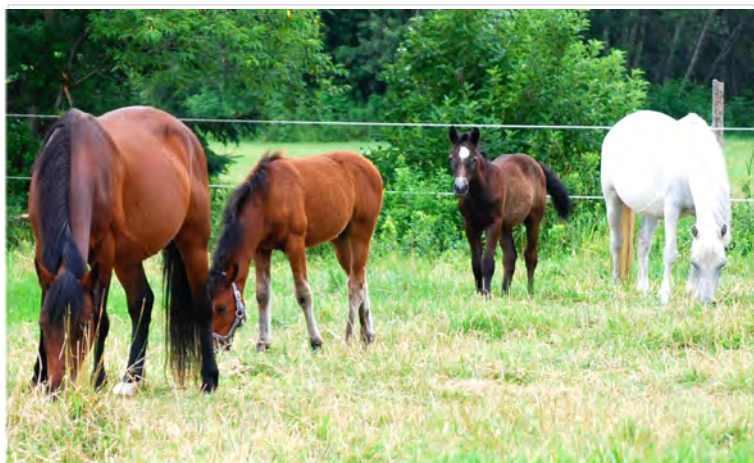
The mares and foals