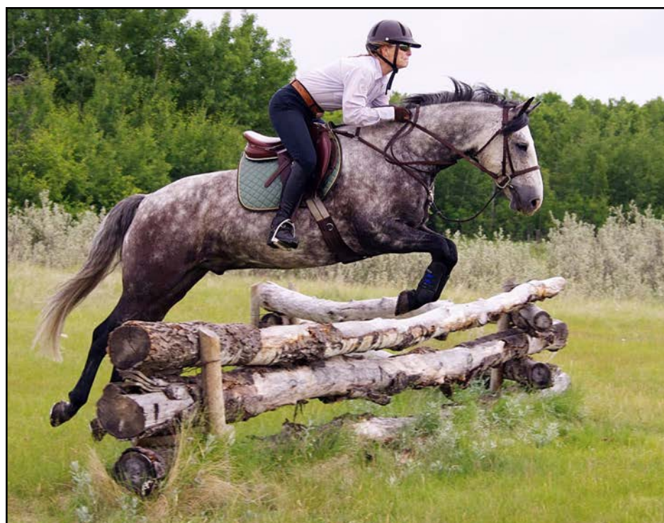
Jumping 3' log fence at the Priddy Hunter Pace