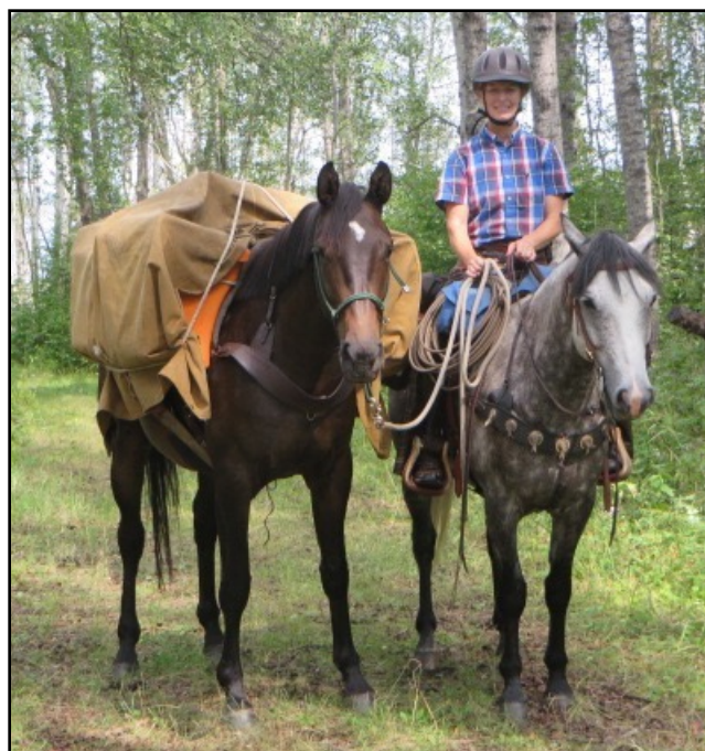
Pack trip in Prince Albert National Park 2015