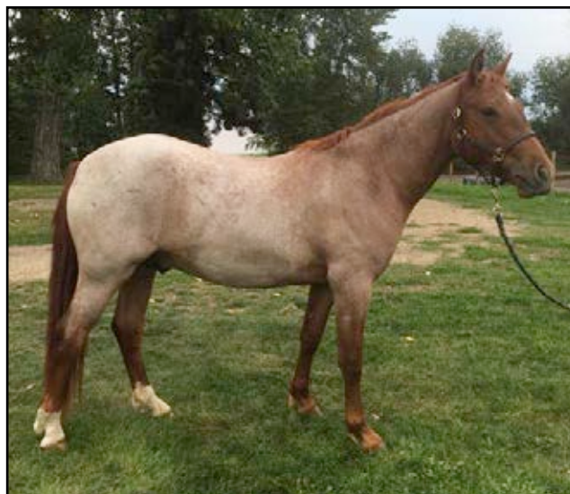
Rills Richochet (Devon Golden Treasure x Holnhorst Branni)