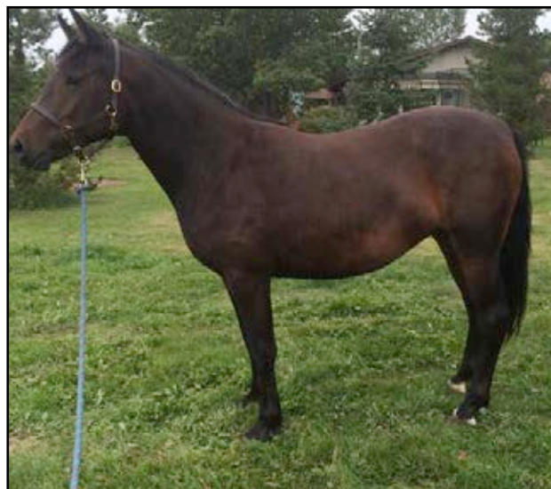
Rills Tia Maria (Rills Kelpie x Holnhorst Branni)