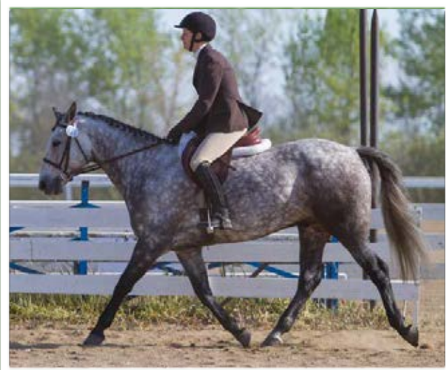
Elodon Earl Grey

Owner/Rider: Jennifer Brownlow Certificate of Achievement in Second Level Dressage Bronze Medal in Second Level Dressage