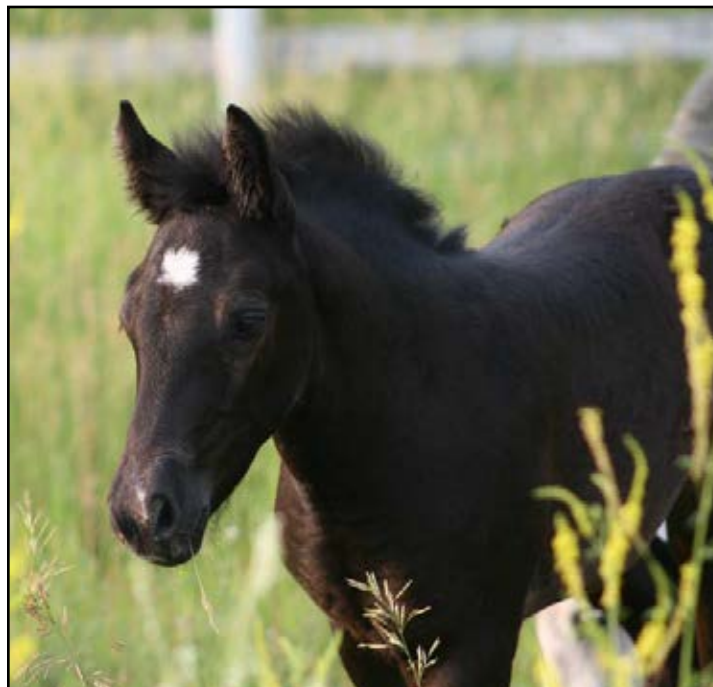
Arya (Century Hills Aedan Zodiac x Devon Ridge Wren)

We had originally planned to sell Arya but as of now no one is talking of finding her a new home anytime soon!!