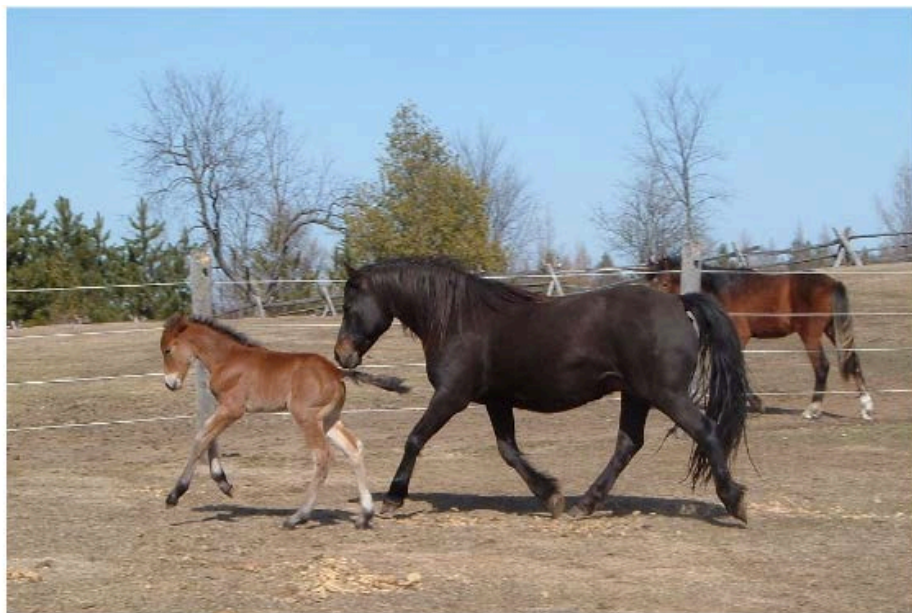
*Scottsway Lullaby with her 2005 filly Elphin Kookaburra, 2004 gelding Elphin Skylark in background.