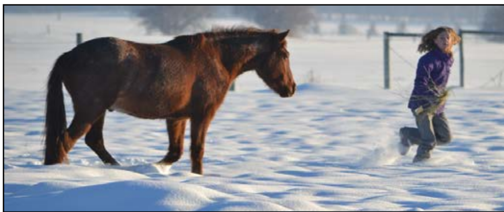
Rills Richochet & Caprice enjoying a romp in the snow!