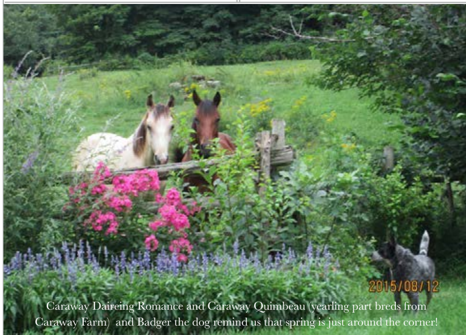
Caraway Dairing Romance and Caraway Quimbeau (yearling part breds from Caraway Farm) and Badger the dog remind us that spring is just around the corner!

Don't forget to regularly check our Societies website for information on how to join, printable forms, awards program, registrations, classified ads and many more pertinent topics! www.canadianconnemara.org