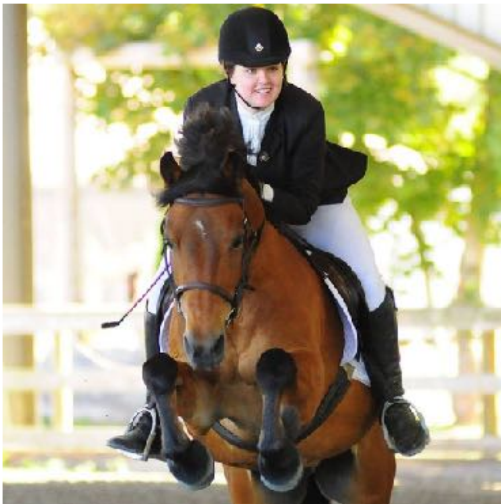
Devonridge Harris Hawk

Harris is a well loved member of our family, and is also well known in our local equine community. We feel fortunate to have this lovely ambassador for the Connemara pony in our family.