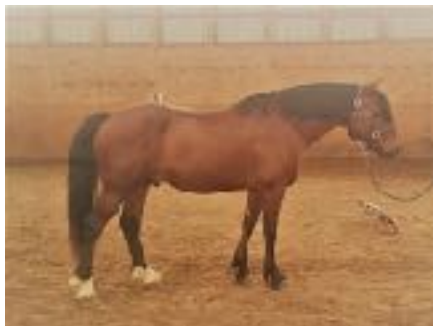
Sire - Patty's Etoile de Paris (Casper)