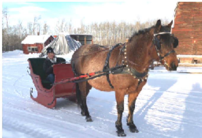
Eden Sugar N Spice.