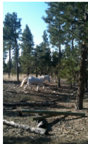
Square Wind (aka "Squire")