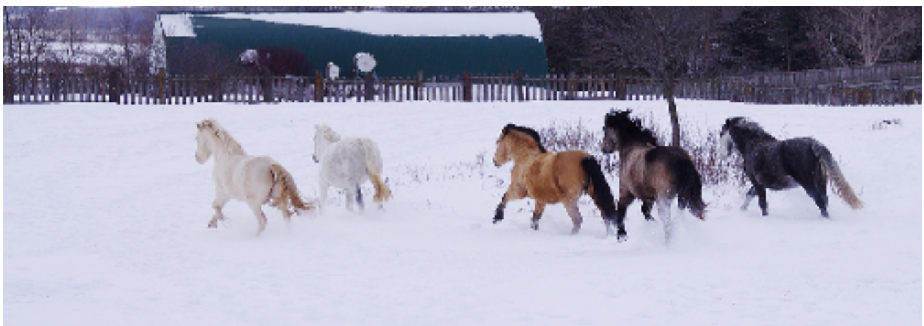
L to r Castlebar Gaelic, Elodon Maeve, Elodon Dara, Elodon Doolin and Elodon Mirren