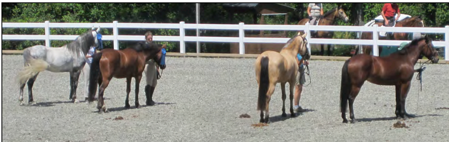
Get of sire class at Woodstock 1st place, get of Irish Park Caraway Finn from left to right: Caraway Brio, Caraway Merle (both out of*Hearnesbrook Shooting Star), Caraway Gilly ( Stonybrook Irish Creme), Tarragon (QH mare)