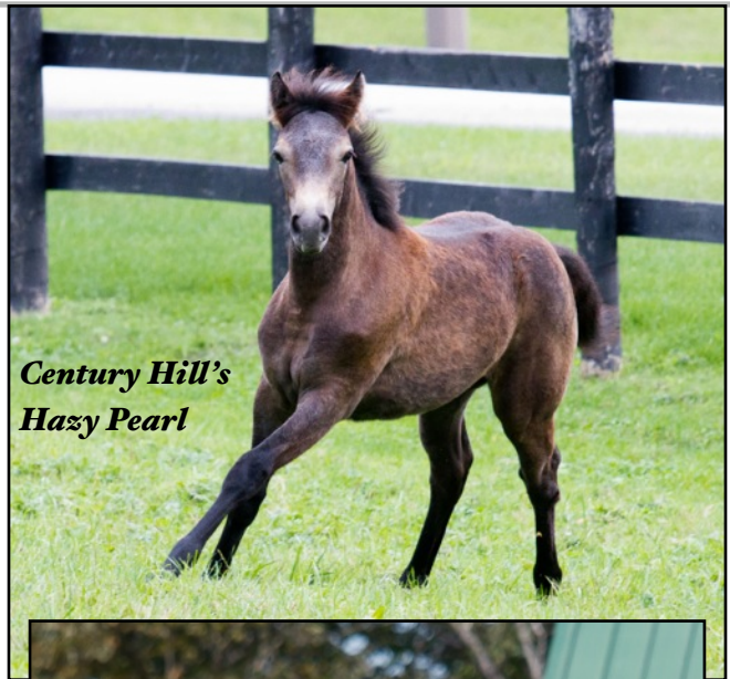
Century Hill's Hazy Pearl