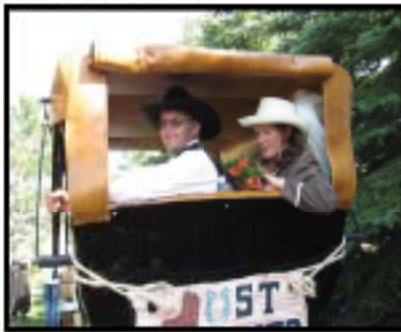
The happy couple!

This was a traffic stopper! After the service the couple was driven back to the farm for a reception.