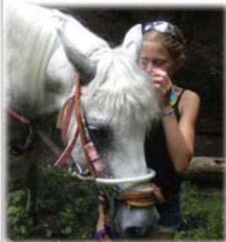
The future directors of the CCPS...