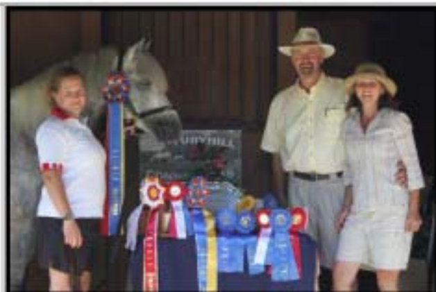
A great day for Centuryhill!

mares in the USA as a result this year! Upon returning, we enjoyed showing in In Hand and Driven Pleasure classes at a local fall fair where Cara brought home a number of red ribbons. After the fall event at Grandview, we have been taking it easy in preparation for getting back into