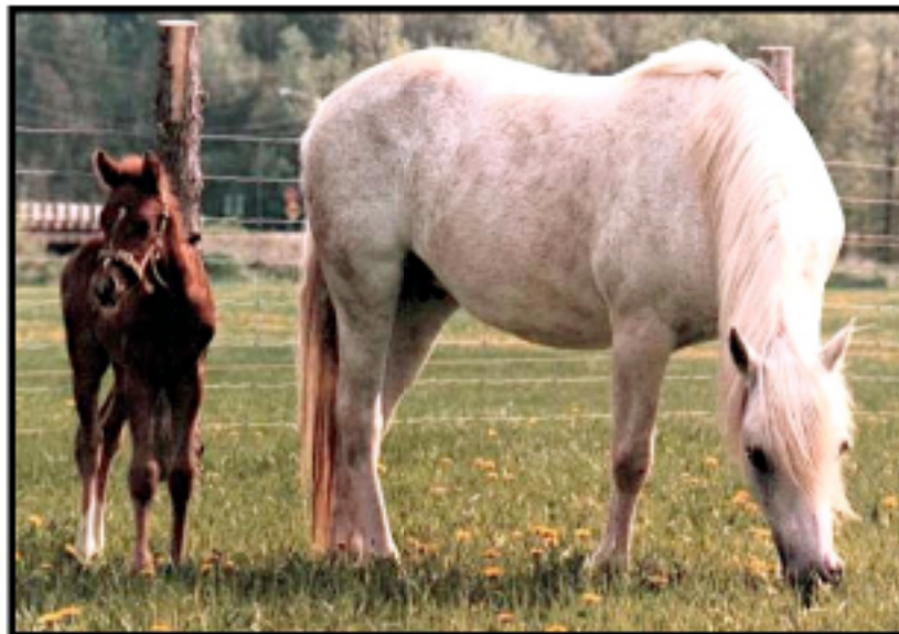
Bluebird with Maplehurst Michael MacDaire at her side.