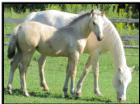
Stonybrook Irish Cream and filly

Hopefully this trend will continue and lead to more members for the society. The numbers on farm haven't diminished as much as it might appear - 2 foals were born this spring and Hilary bought a couple of prospects to bring along.