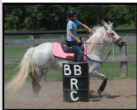
Beaverton Barrel Racing Club event.

liked that too!! We spent our days on the trails, we had picnic lunches and snack breaks. This is when we discovered that Annie loves Kit Kats!! After a long day on the trail, all the other horses were really glad to get back to camp but Annie wanted to stay on the trails and go again! She was the toughest horse on the trail rides and only wanted to get back to get her grain. Annie and I had a great time and we can't wait to go back next year!!