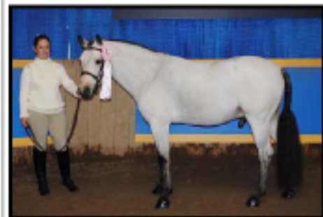
Tibyl placed 6th in the Sport Pony Stallion class at the Royal Winter Fair 2011